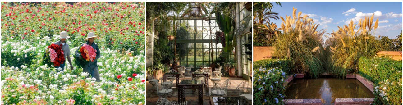
Beldi Country Club

«the one who is from here, and its style is based on the expertise of craftsmen and designers. Maintaining the harmony between the natural environment and human activity is an essential element of the Beldi experience. Beldi not only has a beautiful garden rose but also has its very own on-site souk, selling hand-crafted items including carpets, cushions, bags and bread that is homemade using Beldi olive oil. Another thing to look out for is the Beldi glass, which is blown on site by their own team of glassblowers – the plant here is the last one in Morocco that blows and produces its own glass. beldicountryclub.com