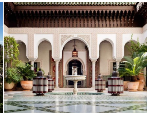
La Mamounia hotel and gardens

Vans will take us back to the hotel. Independent dinners.