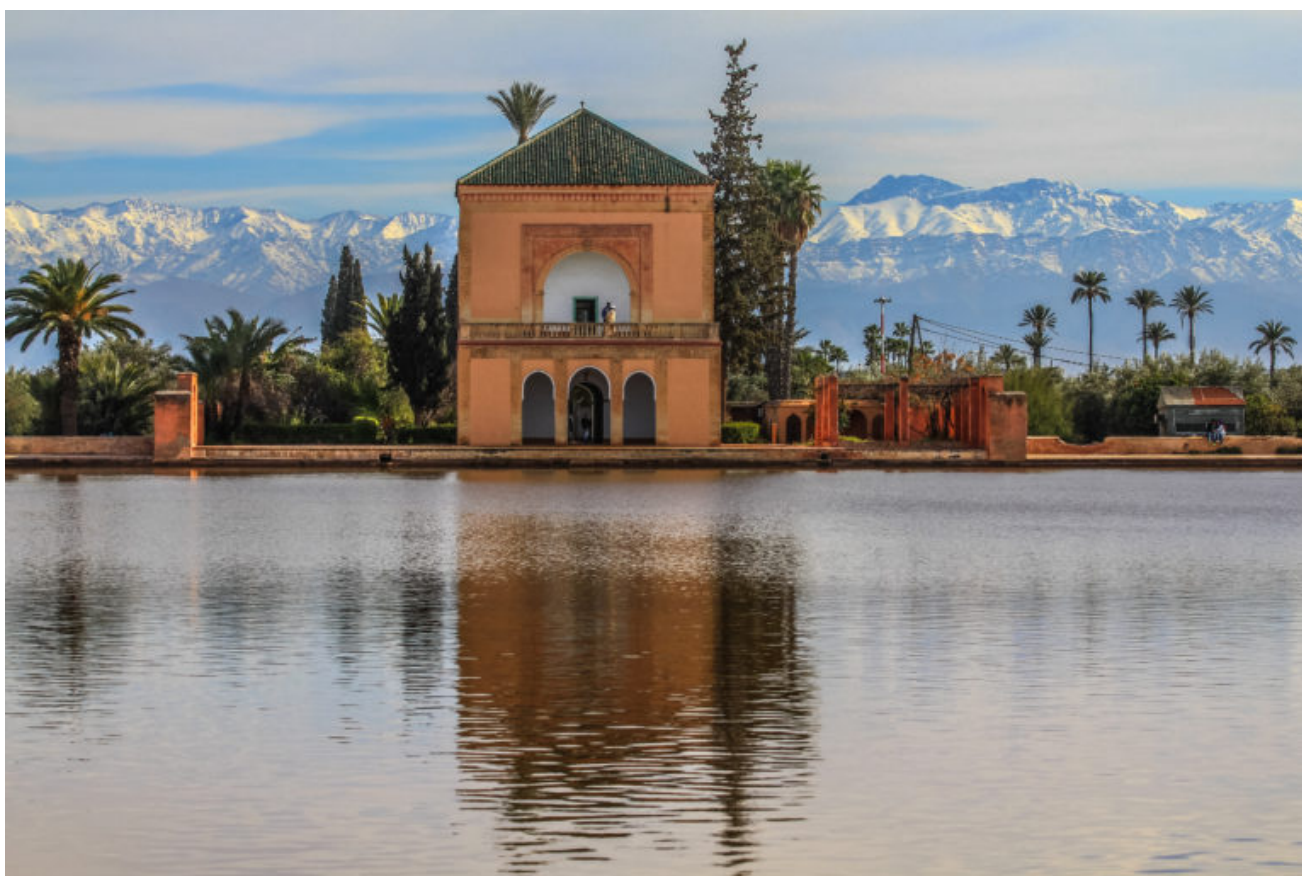
Menara Gardens with the Atlas Mountains behind.

AJH – Associação Portuguesa dos Jardins Históricos