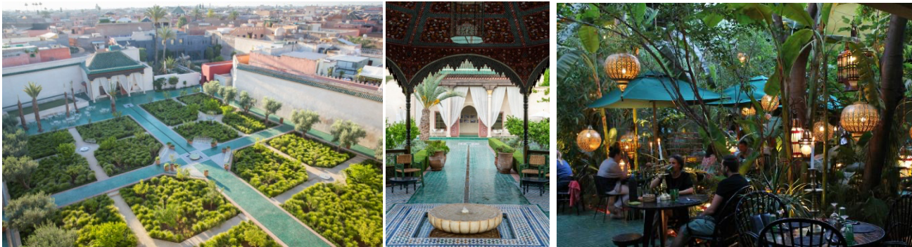
Le Jardin Secret

16h00 Continue-on foot. Visit Dar El Bacha , grand residence built in 1910 and was once the home of Thami El Glaoui, who was appointed as the Pasha of Marrakech by Sultan Moulay Youssef in 1912. In 2017, the building was renovated by the NFM and transformed into a museum that serves as a prime example of traditional Moroccan architecture. This is evident from the fountains, the traditional salons, and the courtyard filled with orange trees.