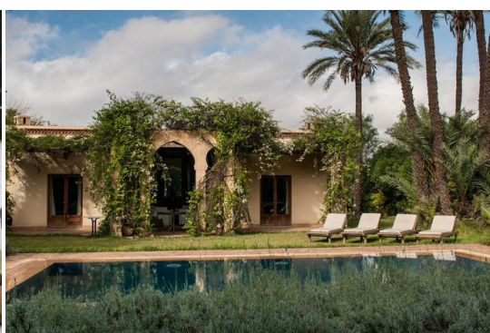
Gary Martin and Meryanne from Jnane Tamsna

The garden is traditionally designed with a modern touch illustrated through its sustainable and ecological approach. The name Jnane refers to the combination between the palm trees and fruit trees that grow freely. The architecture of the garden finds its origins in the arsat model, a combination between heights with the palm, lemon, olive, figs pomegranate and mulberry trees; surrounded by jasmines, roses, lavender and other aromatics plants (as in the Persian model of garden such as the bustan). [Douar Abiad, Palmeraie, Marrakech 40000] Return to the hotel by van.