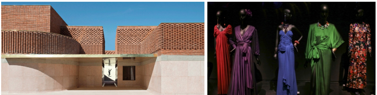
Yves Saint Laurent Museum and YSL designs of the collection

11h00 Visit the Yves Saint Laurent Museum . It was in Marrakech where Yves Saint Laurent had his refuge and found his source of inspiration. Ever since the 60s he would spend a few seasons in Marrakech and in 1980 he bought with Pierre Berge, his lover for two decades and business partner for half a century, the magnificent villa they named Villa Oasis . They cherished their villa and restored the garden, opening the Majorelle Garden to the public. The Yves Saint Laurent Museum is a chef d'oeuvre designed by Studio KO; it opened on October 16th, 2017. The museum holds more than 40 years of Yves Saint Laurent's work exposed in a space of 4000 m2 www.museeyslmarakech.com/en