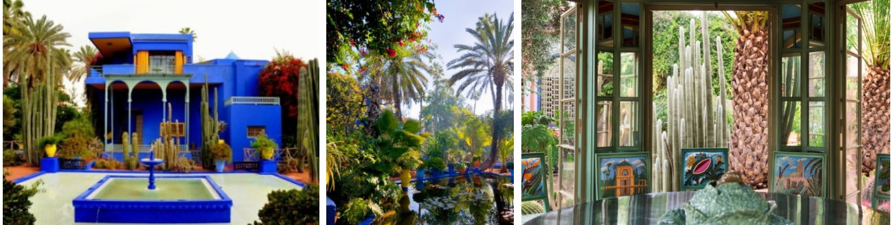
Jardin Majorelle and Villa Oasis interior

We will also visit the fascinating Berber Museum , with objects collected by Pierre Bergé and Yves St. Laurent. jardinmajorelle.com/ang